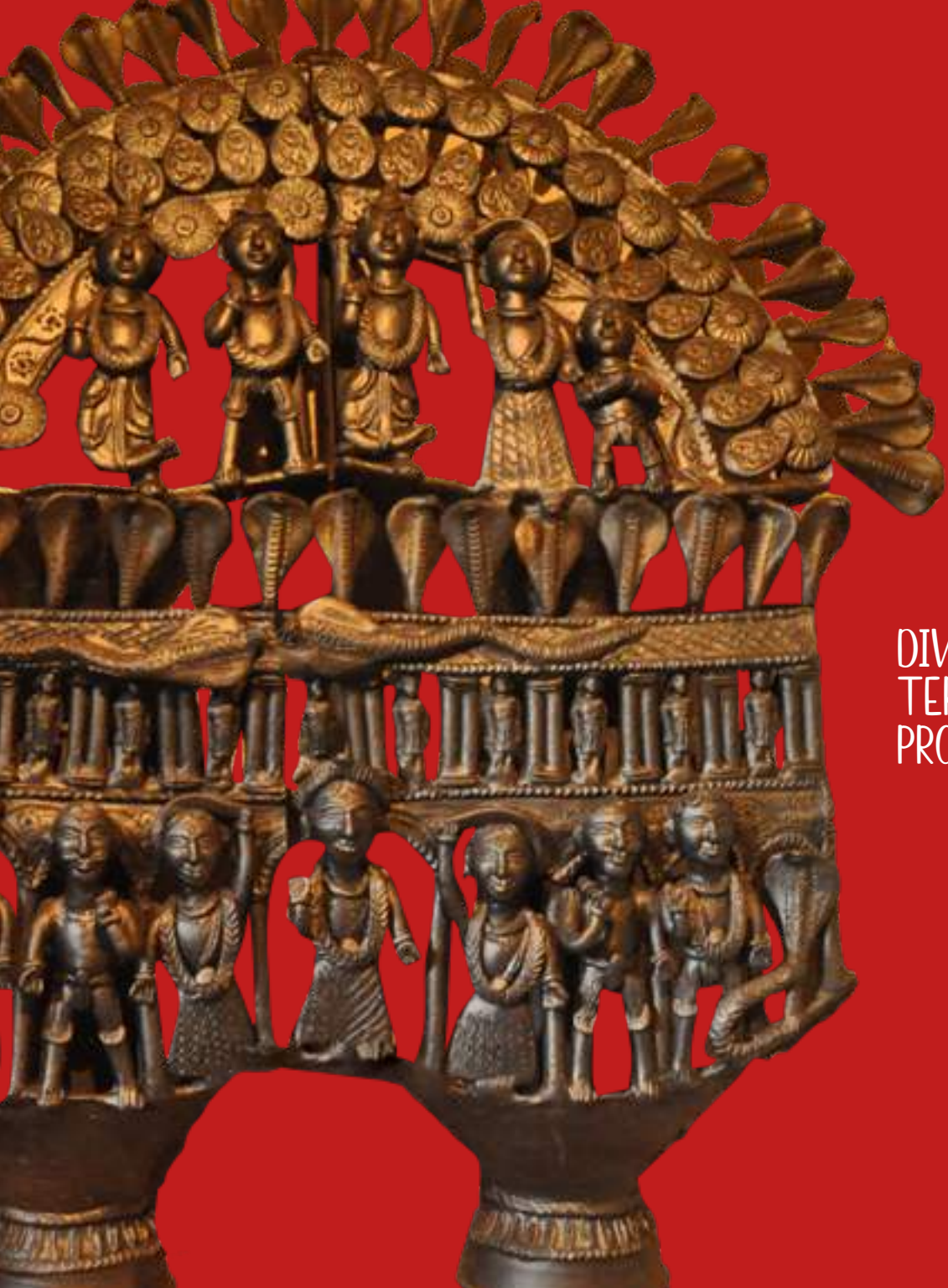
DIVERSIFIED TERRACOTTA PRODUCTS