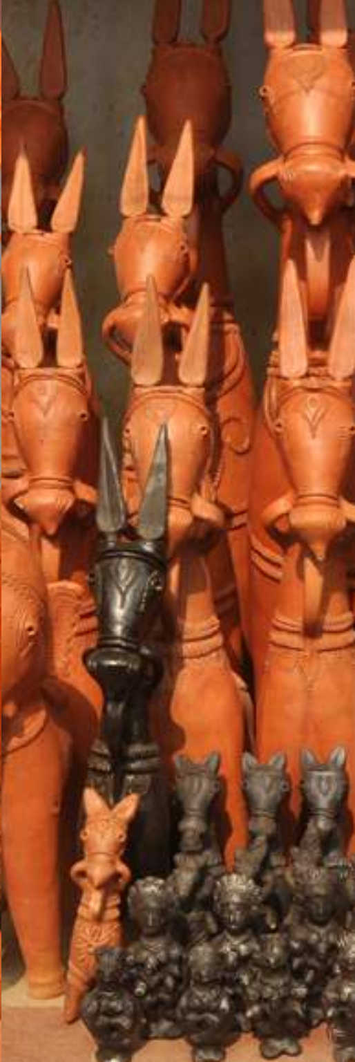
TRADITIONAL TERRACOTTA HORSES