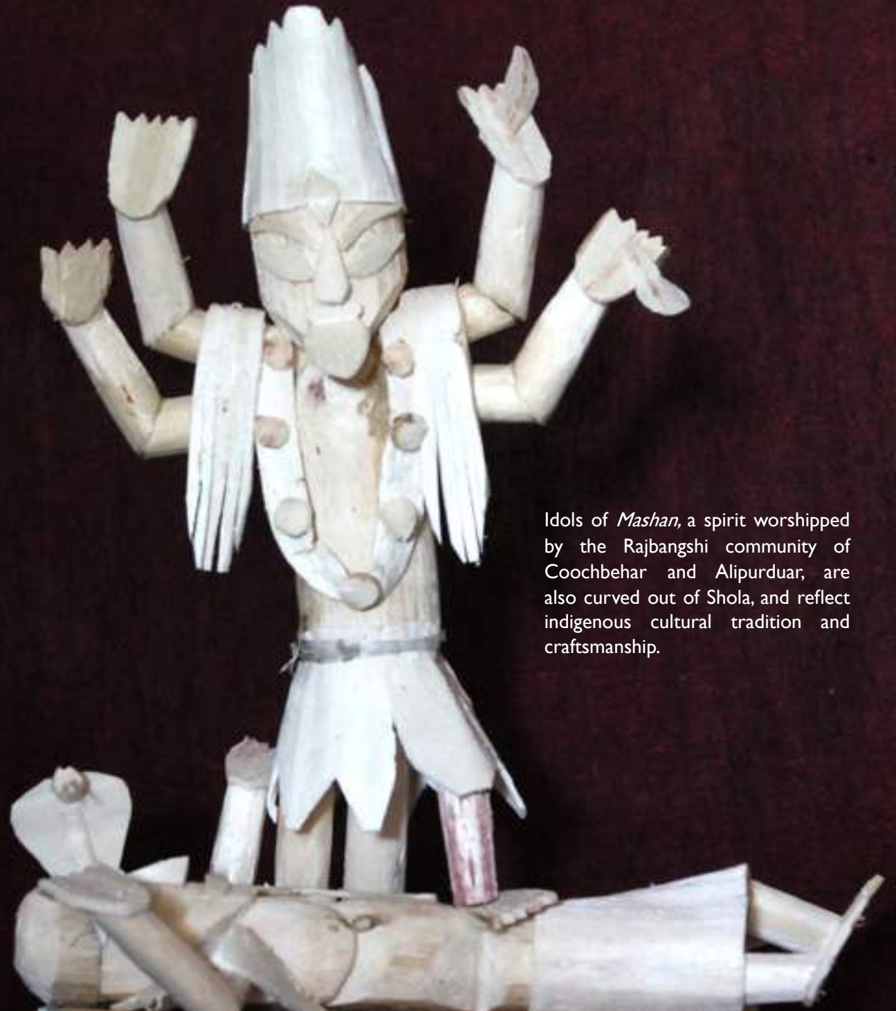
Idols of Mashan , a spirit worshipped by the Rajbangshi community of Coochbehar and Alipurduar, are also curved out of Shola, and reflect indigenous cultural tradition and craftsmanship.